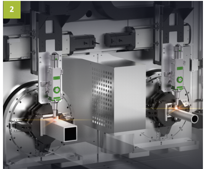
Simultaneous or asynchronous independent cutting