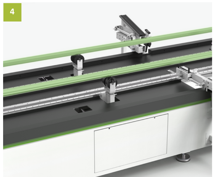
Simultaneous processing of two tubes