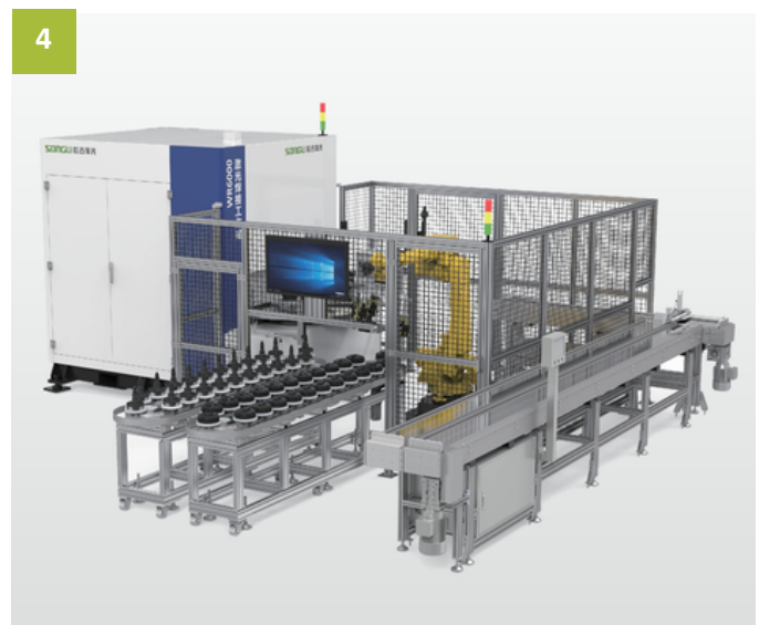
Comprehensive safety equipment and measures