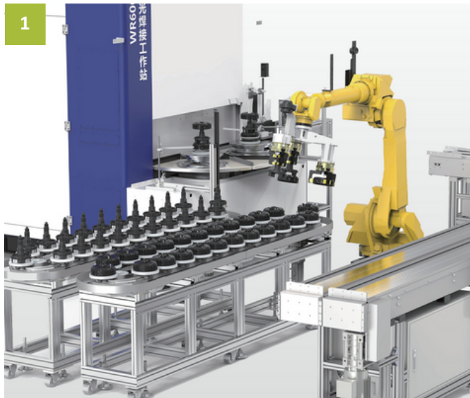
Automatic loading and unloading