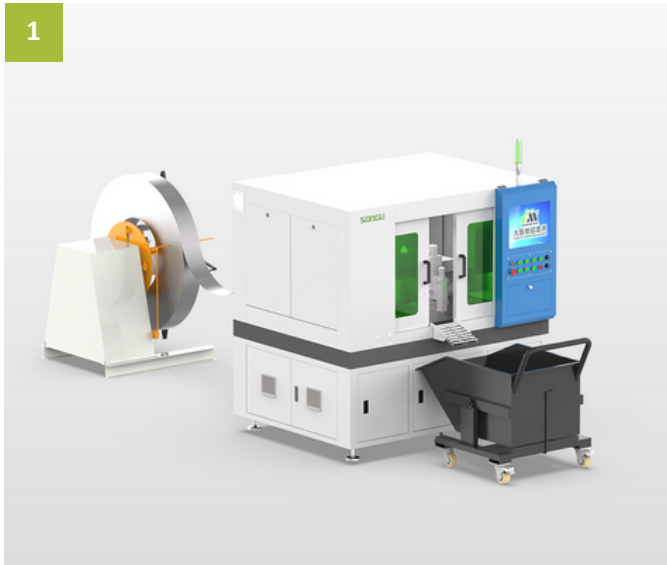
Linear motor gantry dual drive structure