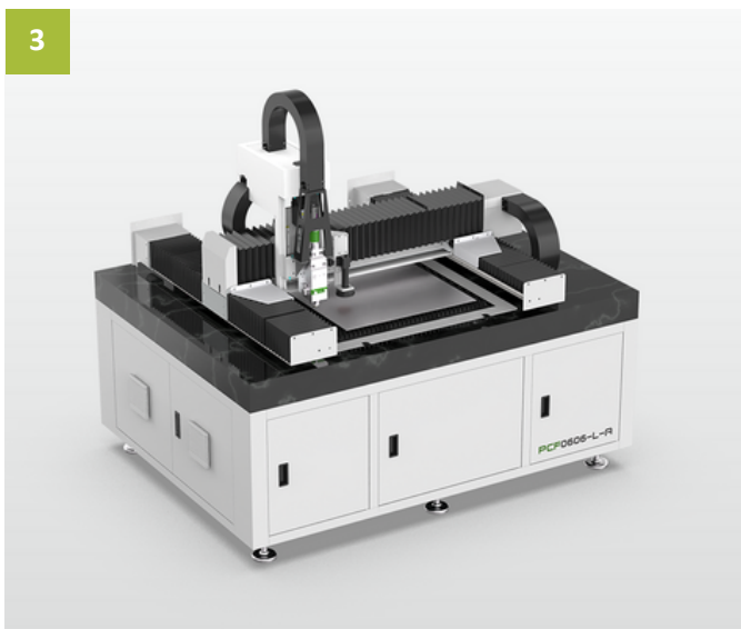
Marble platform with steel welded body design